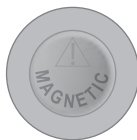
Magnet Backing (use only on request, can be placed anywhere on the badge back & Extra costing)